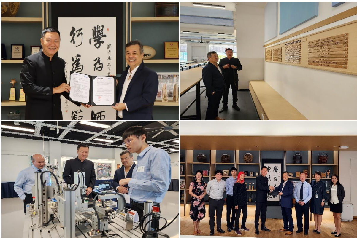
MOU signing between SMC and Spectra Secondary School