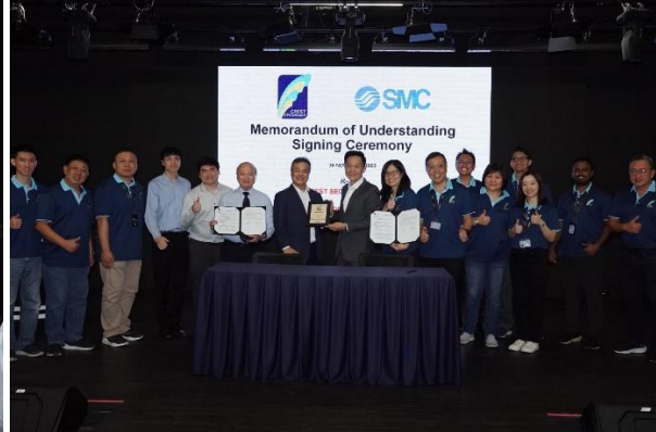
MOU signing between SMC and Crest Secondary School